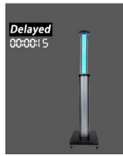
15s start delay