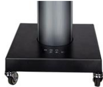
360degree Moving Wheel