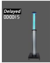
15s start delay